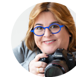
Dania Sander Photographer, Unique Focus